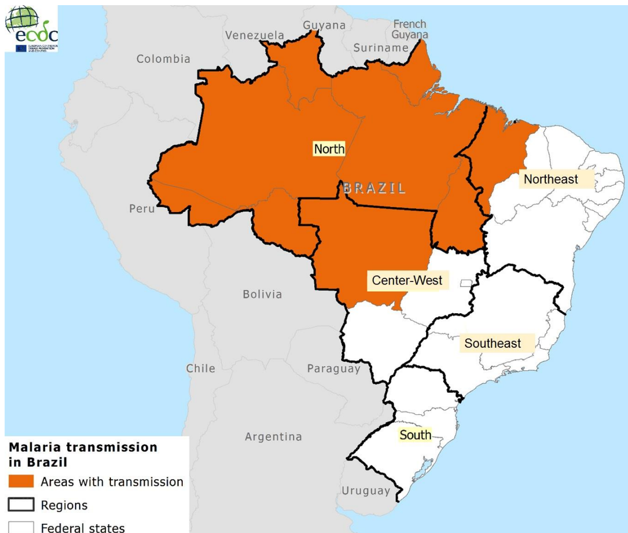
Figure 2. Malaria transmission in Brazil

ECDC. Map produced on 29 Apr 2016. Administrative boundaries: ©EuroGeographics, ©UN-FAO