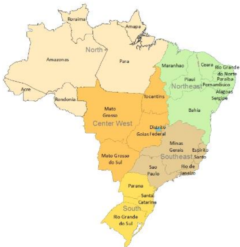
Figure 3. Regions and states in Brazil